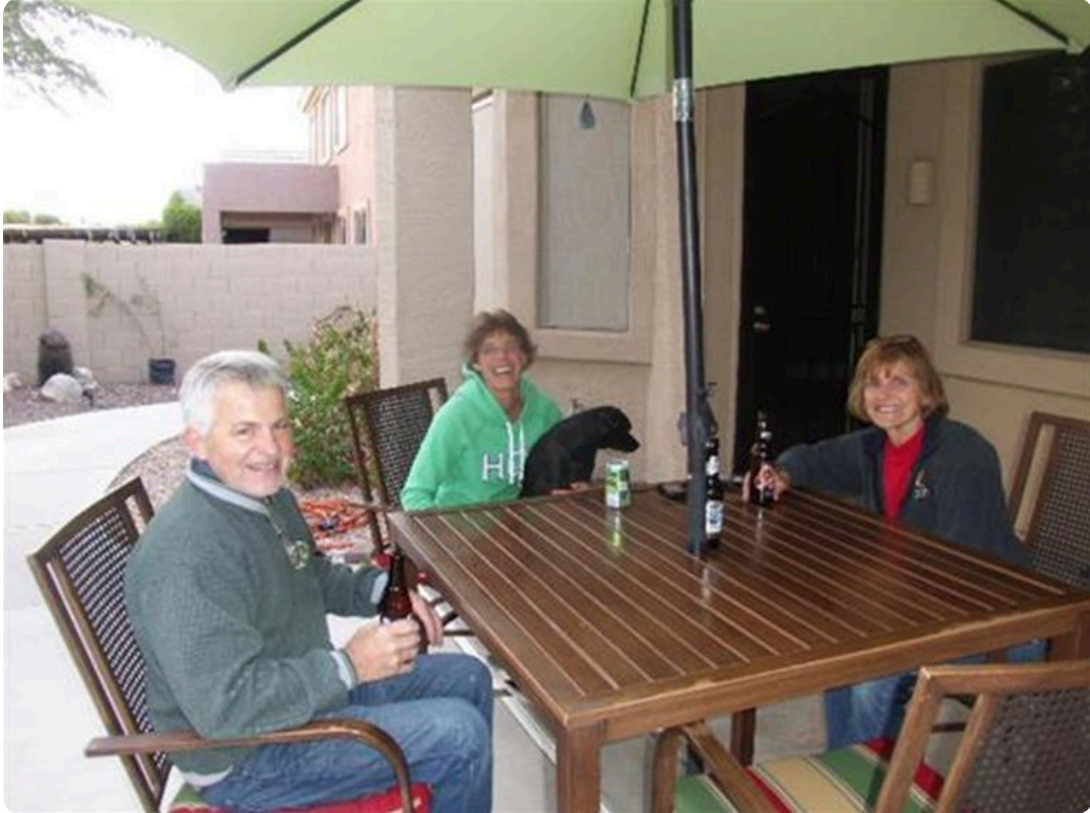
Chillin on the patio Jan. 2016