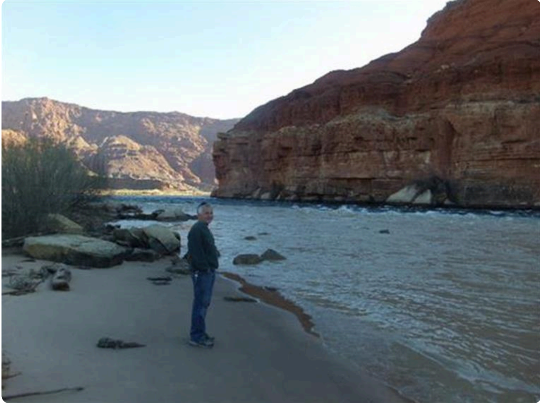
Along the Colorado River AZ